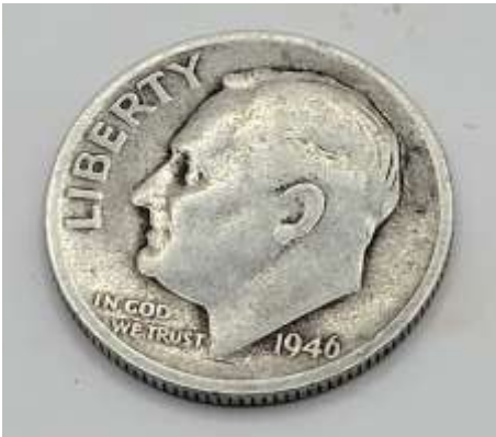
Best N/A Coin