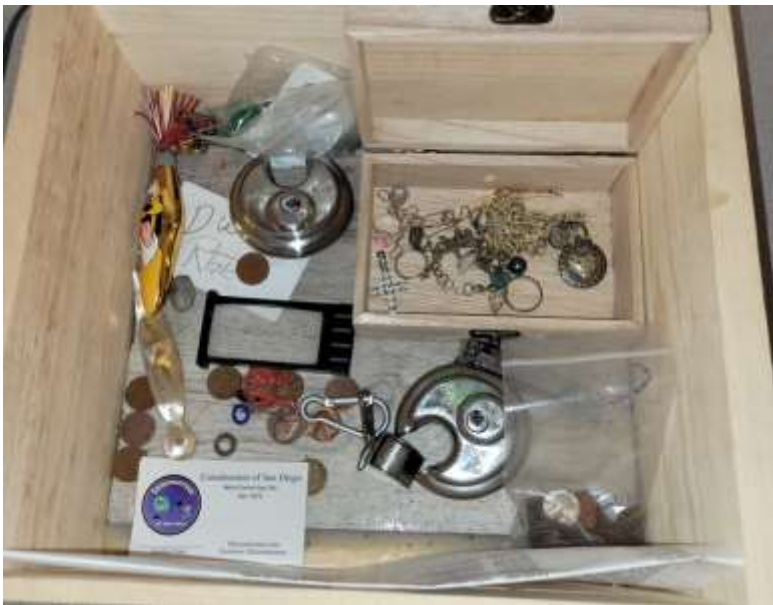
< Dwight Reed